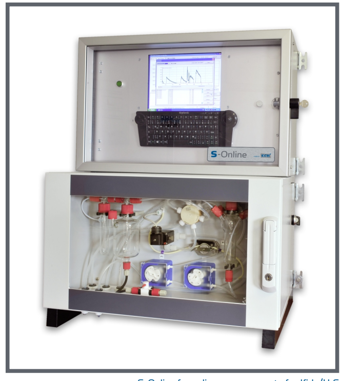
S-Online for online measurement of sulfide/H<sub>2</sub>S

S-Online can be used as a H_2S dependent controlling system for chemical wastewater treatment. The results can be transferred through digital alarm- and analog outputs into the measuring station.