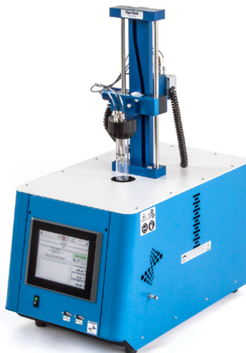
NewLab 300 ST