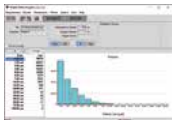
User interface of PAMAS PMA software