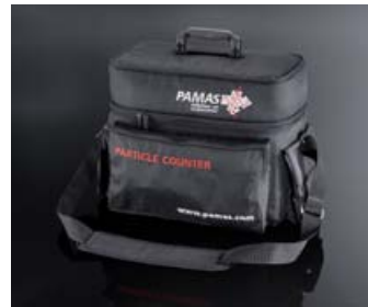
Carrying bag for PAMAS GO case

The optional carrying bag for the rugged case PAMAS GO is equipped with a shoulder strap and with three handy side pockets.