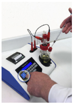
Water check button and syringe

The versatile Aquamax KF Plus is suitable for a wide range of applications and offers many advantages including a tough measuring vessel, a 'press go' keypad and built-in printer.